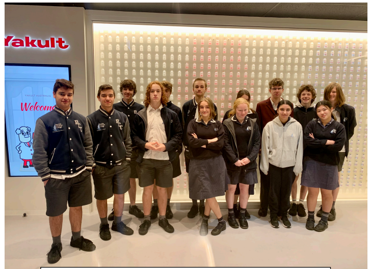
Excursion to the Yakult Factory

Studying Business Management offers a solid foundation for a successful and rewarding career. With a focus on essential business principles, strategic thinking, and practical skills development, you are equipped with the tools you need to thrive in today's competitive business world. The VCE Business Management Study Design follows the process from the initial idea for a business concept, to planning and establishing a business, through to the day-to-day management of a business. It also considers changes that need to be made to ensure the continued success of a business. You will develop an understanding of the complexity of the challenges facing decision-makers in managing businesses from a biblical perspective.