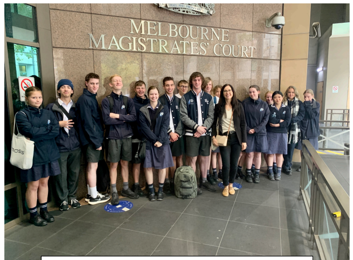
Excursion to the Melbourne Magistrates' Court

Studying Legal studies will give you knowledge of constitutional, criminal, and civil law which is useful for a diverse range of careers in law, policy, business and government. You will learn about how our laws are made, about human rights and how you can make a difference and be a positive influence. You will learn about our court system, our parliamentary system and our role as citizens in a democratic society. You will also learn to think critically and evaluate the effectiveness of our legal system in achieving justice in terms of access, fairness and equality, and from a biblical perspective.