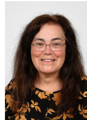
Secondary School Administrator