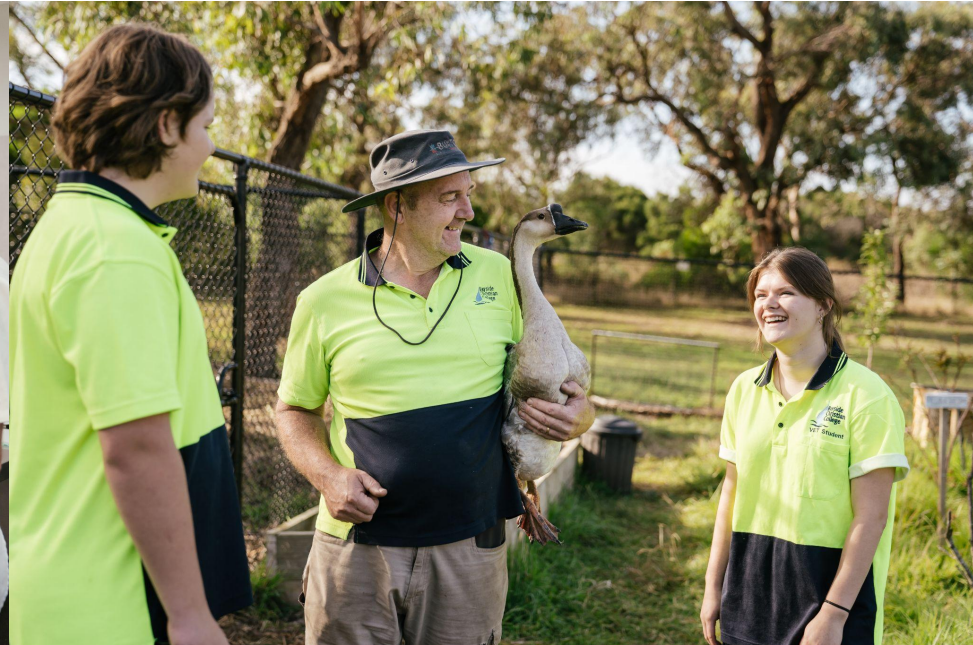
Certificate II in Agriculture