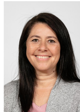
Carers & VET Coordinator