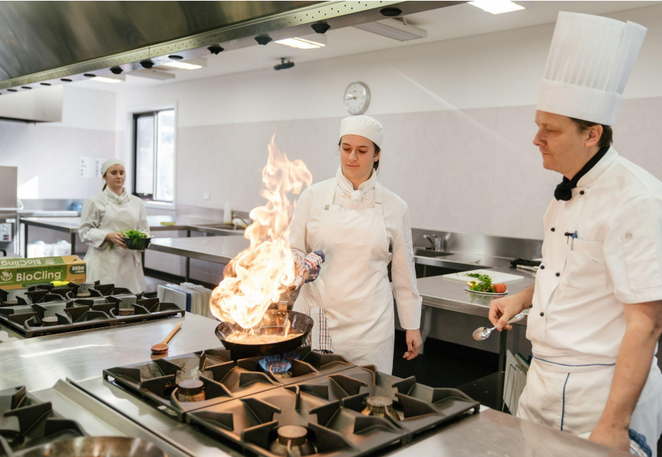
Certificate II in Kitchen Operations