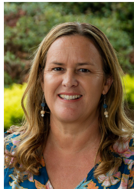
7 - 9 Coordinator