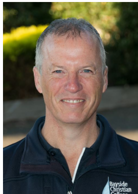
TSC Manager and VCE VM Coordinator