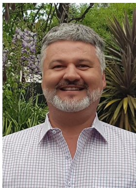
Head of Secondary