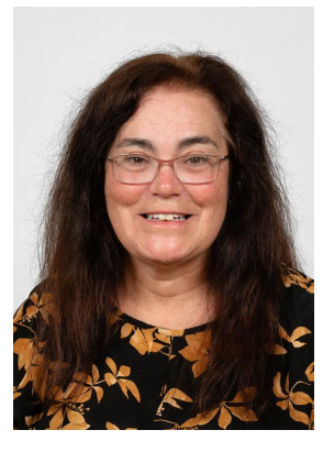
Secondary School Administrator